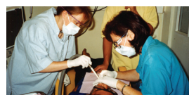
Amazon, Brazil Dental Treatment