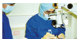
Dom. Republic Cataract Removal