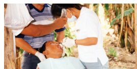
Haiti Village medical clinic