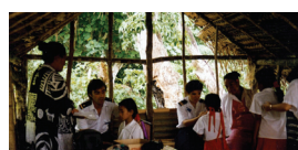
Village Medical Clinic